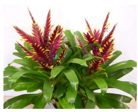
Vriesea hybrid ??? grown by Laurie Mountford