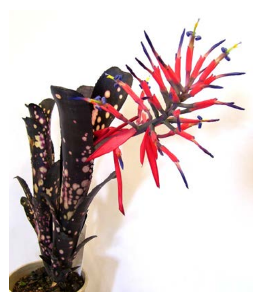
Billbergia 'Canvey Black' grown by Gloria Dunbar