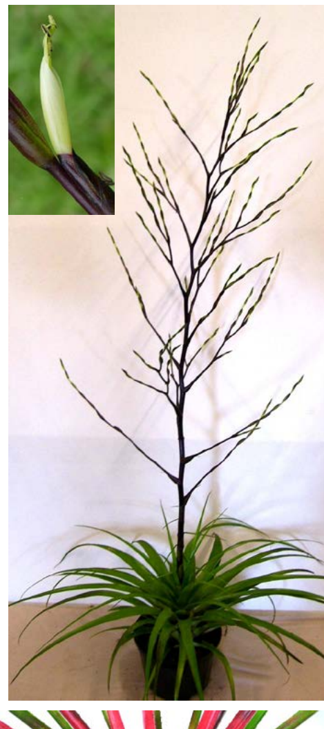
Aechmea kentii grown by Ross Little