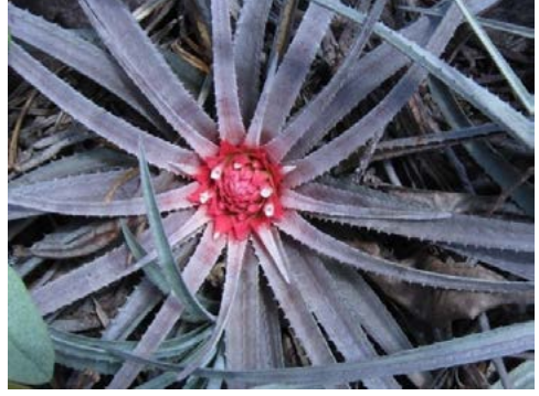
Orthophytum burle-marxii from just north of where Orth. albopictum grows

the ranges of Orth. albopictum and Orth. burle-marxii overlap, but for the most part they are separate and there appear to be no reports of the two species growing together. The mixed population perhaps has some genetic influence from Orth. burle-marxii but if so, it may have been a past event which has been since obscured by back-crossing between hybrids and Orth. albopictum . There do not appear to be any typical Orth. burle-marxii growing in the near vicinity at present. It would be very interesting to explore the intervening area between the currently-known range limits of Orth. albopictum and Orth. burle-marxii to see whether the two species do occur together. The habitat is continuous and there are no obvious barriers to the distribution of either species in the intervening area.