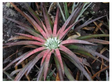
Orthophytum ? albopictum lepidote form

However, plants in the Mucuge area are quite variable. Many plants have grey leaves with at least a sparse covering of scales and the green sepals often appear white because they are densely covered by white scales. In some plants, the leaf scales are sufficiently dense that they obscure the normally bright red leaves of flowering plants so they appear dull. Non-flowering plants of this type look very similar to Orth. burle-marxii .