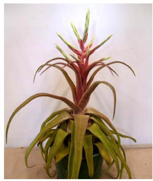
Tillandsia streptophylla grown by Ross Little