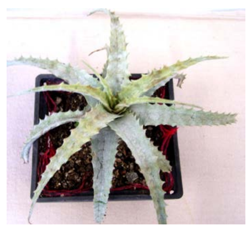
Cryptanthus warasii Equal 1st Novice Les Higgins