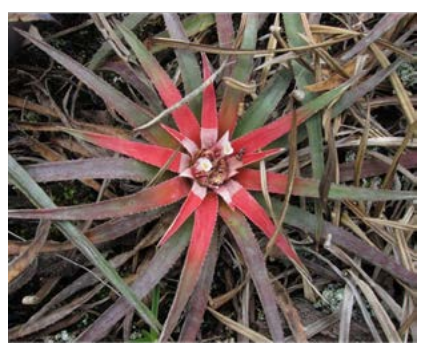
Possible Orth. albopictum - Orth. ulei hybrid or intergrade

surface of the leaf (supposedly smooth in Orth. albopictum but note above comments on the Mucuge population) and by pink sepals (green in Orth. albopictum although as noted above the sepals seem to often be obscured by dense white scales). I have not visited the type locality of Orth. ulei , but a little to the west there are some plants which agree well with the description of this species.