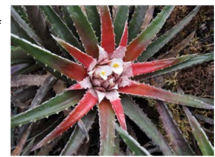
Possible Orth. albopictum - Orth. ulei hybrid or intergrade

colouration with very obscure band around the inflorescence. Not far away (a few tens of metres) in the same population, there are a few plants which closely match the typical form of Orth. albopictum with green (or white lepidote) sepals. In any case, it is difficult to judge the full extent of variation in this and other nearby populations from a brief visit, because only a small proportion of plants are in flower at any one time.