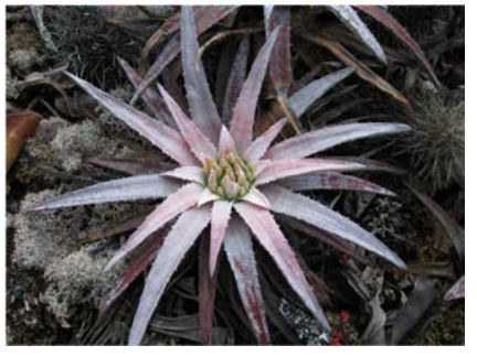
Orthophytum ulei light pink form

A related species, Orthophytum ulei , was described only recently (as part of the 2010 revision), from an area which appears to be close to the north-eastern limit of the distribution of Orth. albopictum . In the protologue, Louzada and Wanderley cite three specimens, but two are from a single locality and the other is non-localised and may also be from the same locality. They note that it is similar to Orth. albopictum but differs by being lepidote (with tiny scales) on the upper