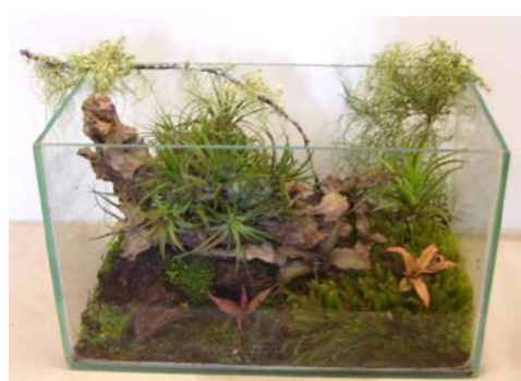
'Garden in Glass' grown by Helen Clewett