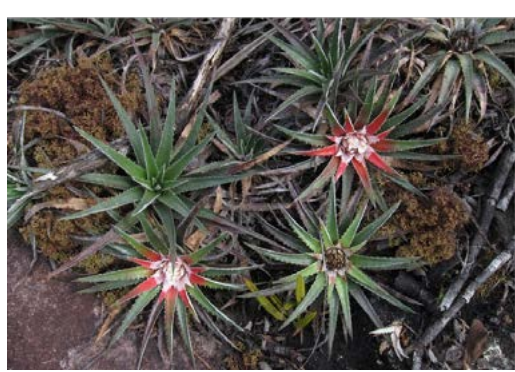
Possible Orth. albopictum – Orth. ulei hybrid or intergrade

Alternatively, the mixed population may be part of a hybrid swarm between Orth.