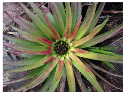
Orthophytum? albopictum naked form, past flowering

spines than either of those species and neither of those species has been recorded in the Mucuge area. Are these plants an extreme form of Orth. albopictum or do they belong to a separate, currently undescribed, species? Seeing the naked green form growing immediately adjacent to the grey form it would be easy to conclude the latter, but intermediate forms also occur so this question will remain unanswered until someone can look more closely at the variation.