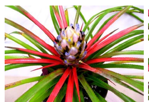
Aechmea napoensis grown by Ross Little